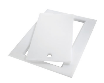
HPDE Twin chopping board 8644 101