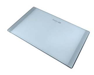
Glass chopping board 8633 300