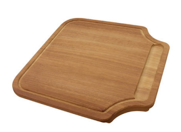
Iroko-wood chopping board 8646 000

* only in combination with the accessory 8644 101