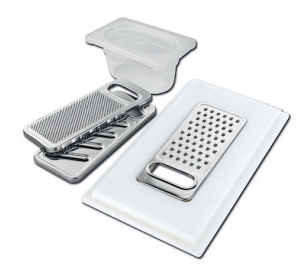
Graters kit with ring-holder and food collection tray