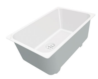
White bowl 8153 100