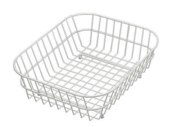
Cestello inox 8612 000